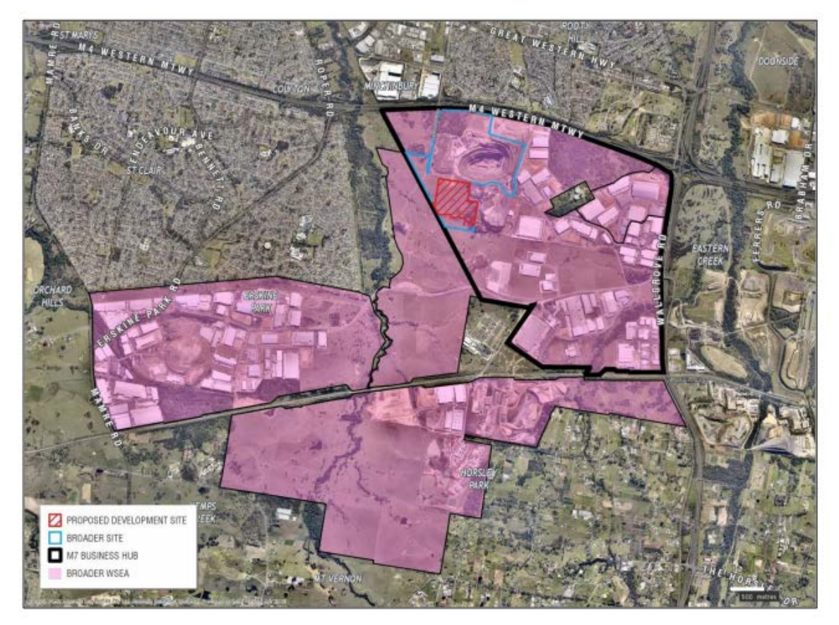
Figure 3 Map demonstrating regional context of proposed site

https://majorprojects.accelo.com/public/37ce9bc9707ea35fd5137bdab2f7667a/Amended%20EIS_%20%20Eastern%20Creek%20Energy%20from%20Waste_%20Volume%201A.pdf