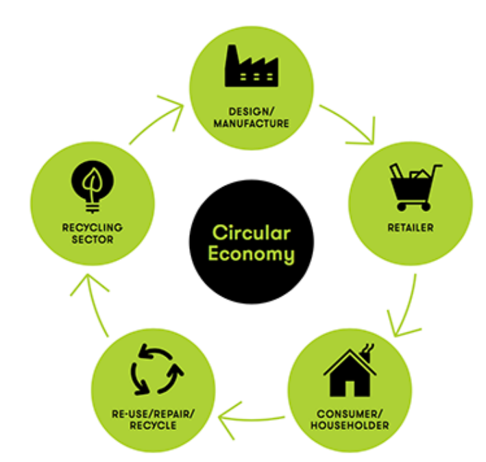
Table 8The circular economy

8.81 According to the Australian National Waste Report, unlike the traditional 'take, make and dispose' economic model, the circular economy 'envisages keeping products, components, and materials at their highest utility and value at all times'.<sup>813</sup> Veolia reported that Australia is set to garner approximately $26 billion in value from the circular economy by 2025.<sup>814</sup> Green Industries SA developed the infographic below to demonstrate the circular economy.